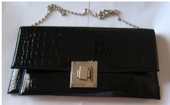
my black purse