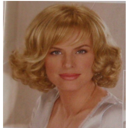
my selected hairstyle

Next hurdle: Security on May 14th. Wish me luck.