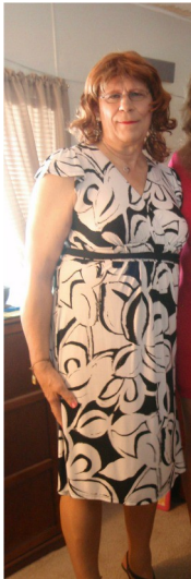
My selected dress

My Jury Duty assignment is for May 14, 2015. So far I have marked my calendars, determined which dress to wear and a small purse to carry my minimum personal needs including my id and a book to read since you have to be prepared to stay till 5pm that day.